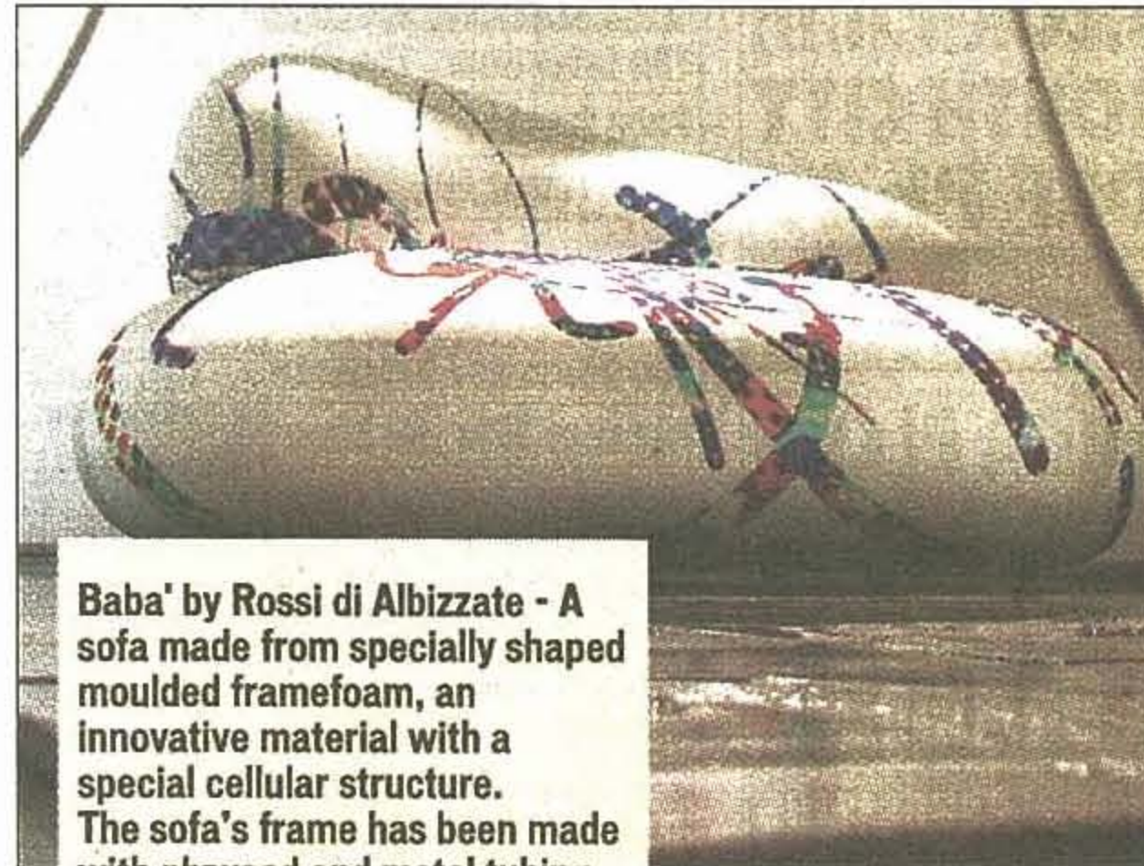
Baba' by Rossi di Albizzate - A sofa made from specially shaped moulded frame foam, an innovative material with a special cellular structure. The sofa's frame has been made with plywood and metal tubing and uses Dupont Dacron for the padding. Its coating is made with a special bi-elastic fabric made of wool and lycra, which is 100 per cent washable